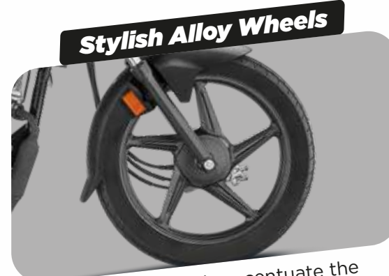
Stylish Alloy Wheels All-black alloy wheels accentuate the overall look of the bike.